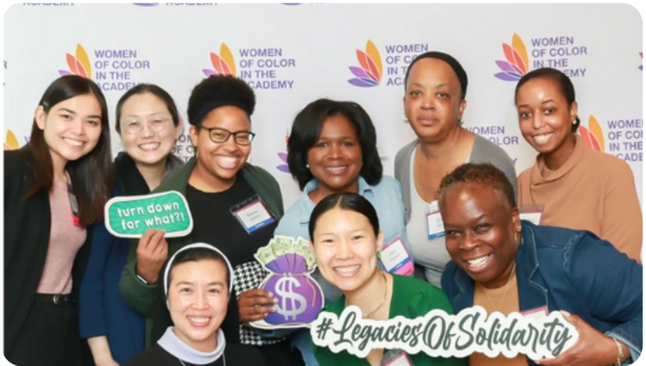
Women of Color in the Academy Conference May 17, 2024