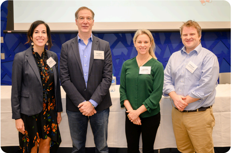
Faculty Development Workshop: The Race to Fenway: Stress and Coping During the Spring Semester March 12, 2024

Capturing moments from last semester's faculty programs and events