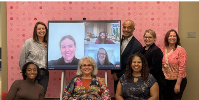
Research Mentor Training