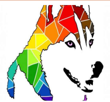
LGBTQA Resource Center