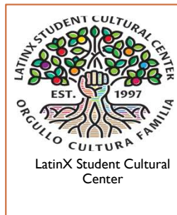
LatinX Student Cultural Center