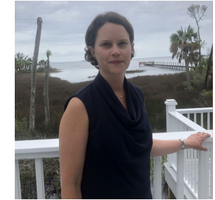
Randall Hughes College of Science