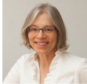
Martha Davis School of Law