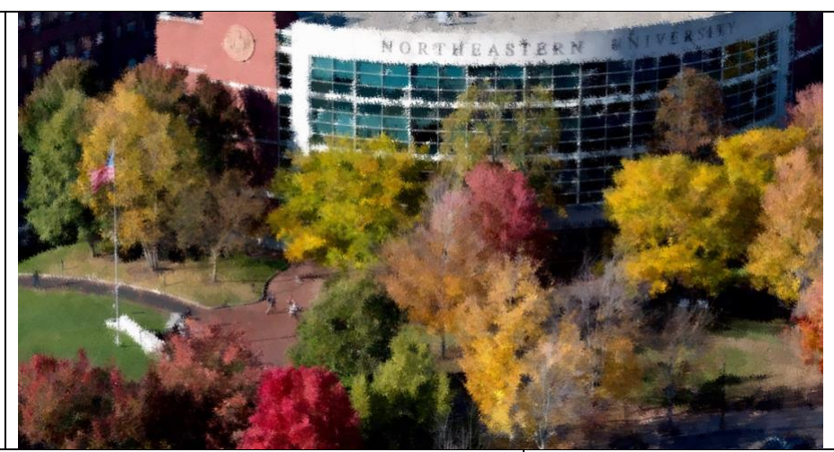
November 3, 2021 Faculty Senate