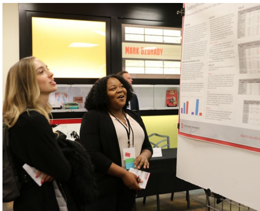
OHIO STATE UNIVERSITY

Like many academic units, the college had repeatedly professed its commitment to social justice and inclusion. But the number of faculty members of color didn't